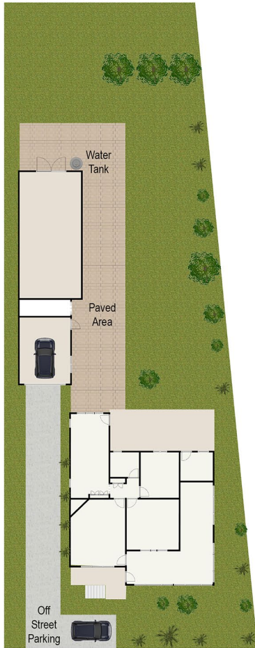
Site Plan (not to scale)

All measurements are approximate. For illustrative purposes only.